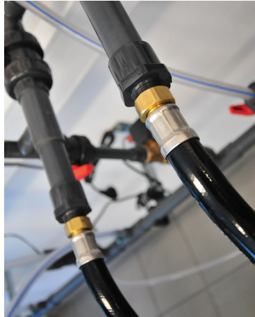
Thread ends: into piping