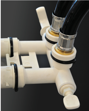
Clip ends: into by-pass